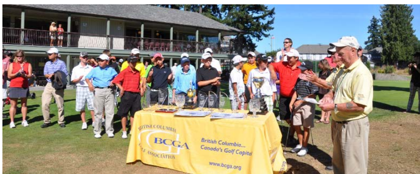
Handing Out Awards