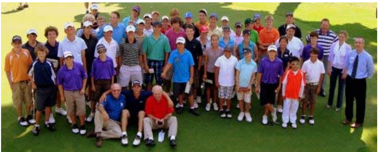
John Hicks Junior Tournament Participants and Organizers