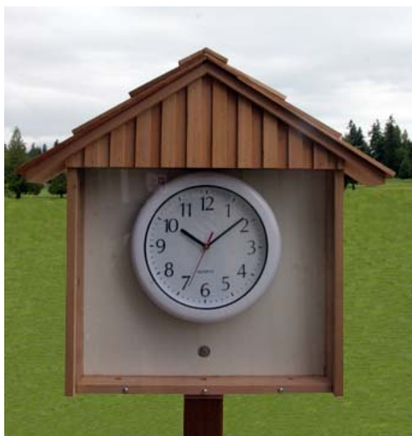
Pace of Play Clock

You must be checked in by 7:45 Sunday morning or your place may be given away. To cancel, phone the Pro Shop before 7:30 a.m.